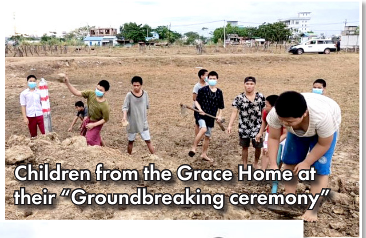
Children from the Grace Home at their "Groundbreaking ceremony"