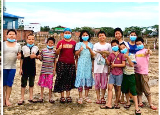
What a treat for the children to play freely outside at the site of their new home.