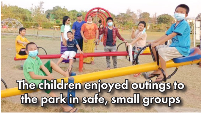
The children enjoyed outings to the park in safe, small groups