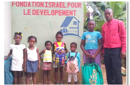
New home in Haiti! See more on page 4