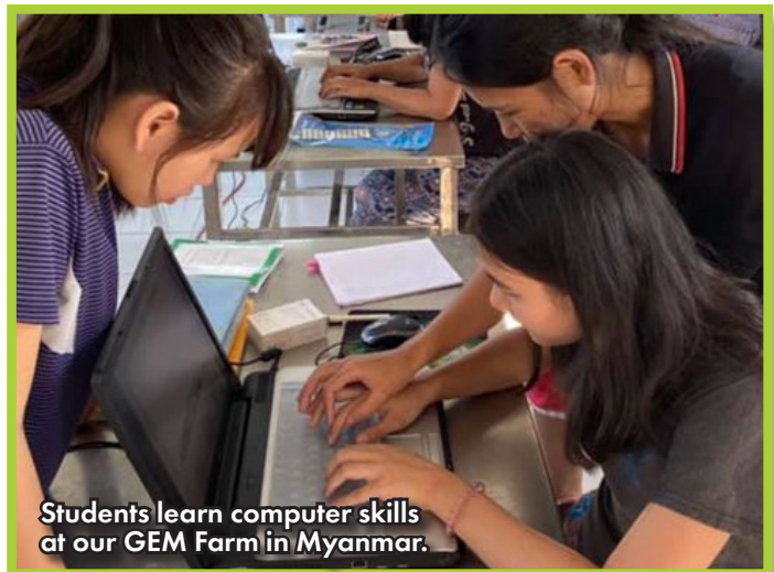
Students learn computer skills at our GEM Farm in Myanmar.

Your sponsorship provides a home, daily living needs, an education, and more importantly, you will build a personal connection as a prayer partner through updates about the child and their home. You can read more about Homes of Compassion on our website and